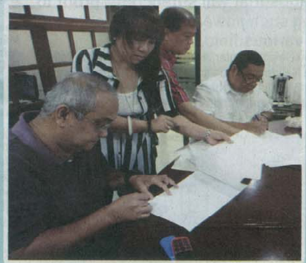
NIA and DENR Tie the Knot for Jalaur

To ensure the protection and sustainability of the Jalaur River in Calingog as main source of the proposed Jalaur River Multipurpose Project Stage II (JRMP II), the National Irrigation Administration Region VI and the Department of Environment and Natural Resources Region VI tied the knot through a Memorandum of Agreement (MOA) titled "Watershed Resource Management Agreement for JRMP II" last January 16, 2014 at the DENR Activity Center.